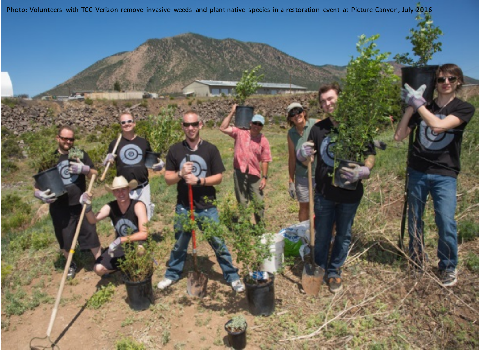
Photo: Volunteers with TCC Verizon remove invasive weeds and plant native species in a restoration event at Picture Canyon, July 2016