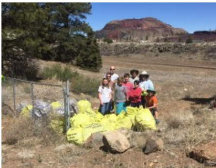
Temple in the Pines collect 29 bags of trash and recycling at Wildcat Reach in April 2016