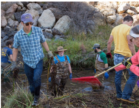
Volunteers clean out vegetation and debris to maintain channel at 2016 Make a Difference Day