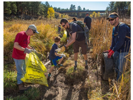
Cub Scout Pack 112 and American Heritage Girls group 112 with adult leaders at 2016 Make a Difference Day