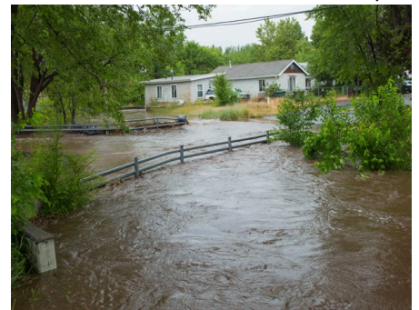
Rio de Flag flooding in Southside will be a major focus of surveys and interviews to be conducted in 2017 using ACF grant funds