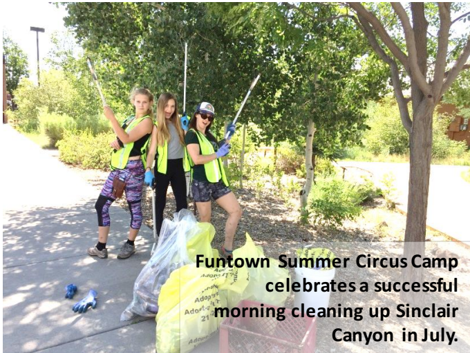
Funtown Summer Circus Camp celebrates a successful morning cleaning up Sinclair Canyon in July.