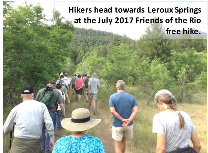
Hikers head towards Leroux Springs at the July 2017 Friends of the Rio free hike.

reached through our website, listserv, and social media