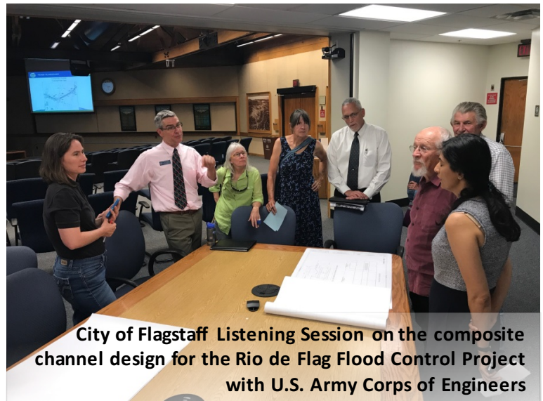
City of Flagstaff Listening Session on the composite channel design for the Rio de Flag Flood Control Project with U.S. Army Corps of Engineers

A watershed plan for the Rio de Flag will give City and County leadership a tool for taking action to address watershed issues in the