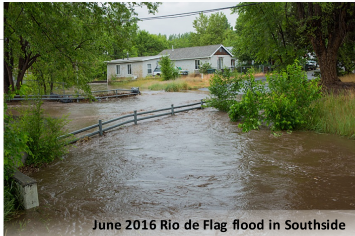
June 2016 Rio de Flag flood in Southside

FoRio has spent the ten years since its formation broadening its focus to the entire watershed with an emphasis on restoration and preservation for the benefit of people and nature. As part of this, the Board of Directors will seek input from membership on an updated position statement for the Flood Control Project that includes a pledge to support the project for its flood control benefits. The statement will be available on our website in Jan. 2018.